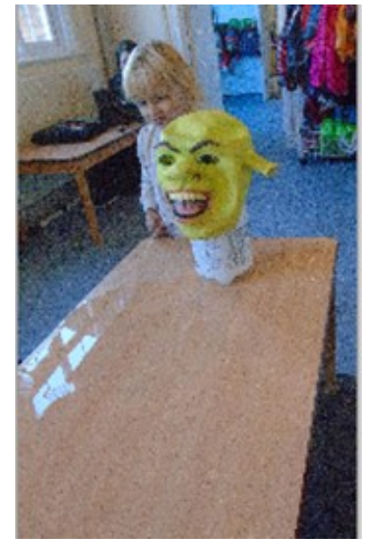
Learning about nasty bugs on the "sneeze runway" "It's gone everywhere, the germs make us sick" "Snotty nose yucky"