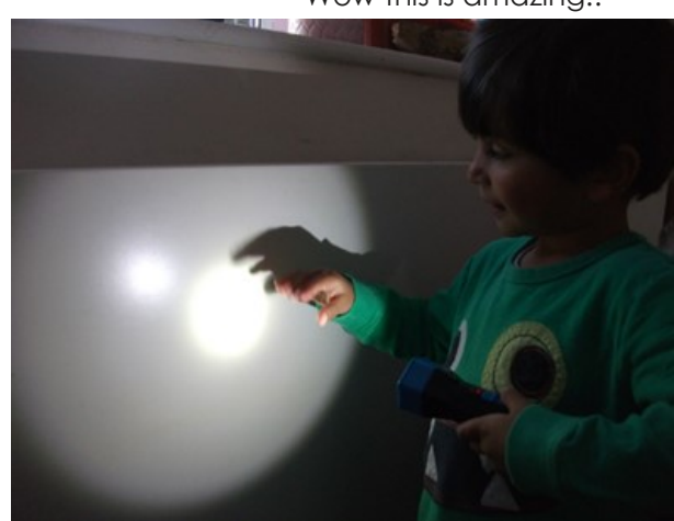
"Wow this is amazing!!"