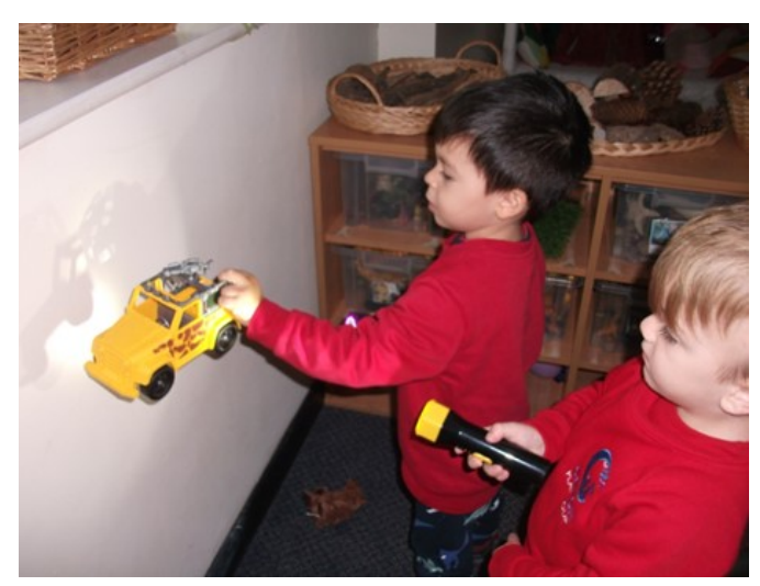
"Now there are 2"