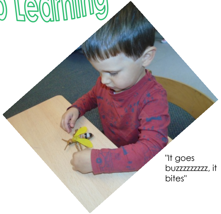
"It goes buzzzzzzzz, it bites"