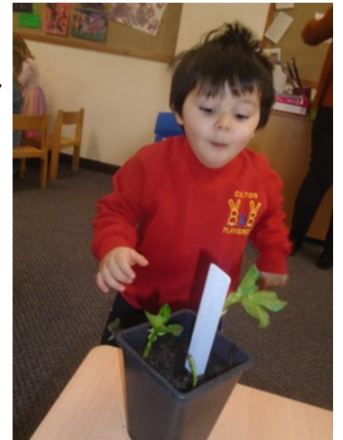
"Wow that's amazing, look how big it's grown!!!"