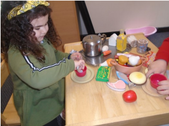
"Would you like to come to tea?"