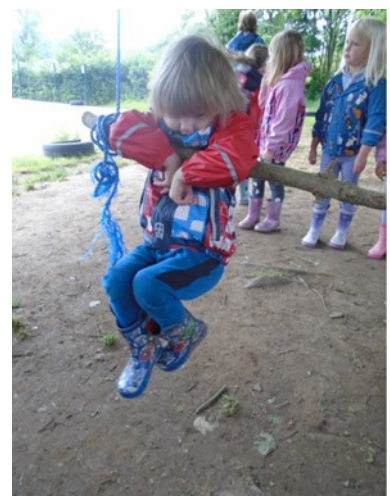
"I can do it" Taking risks and meeting a challenge.