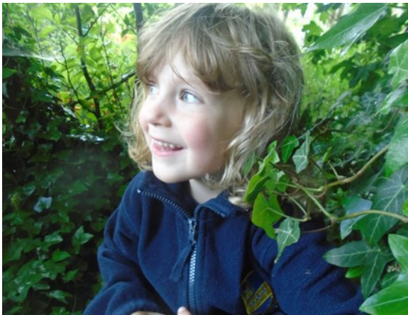
Playing 1,2,3 Where are you? in forest school. "I hid in a good place, you couldn't find me!"