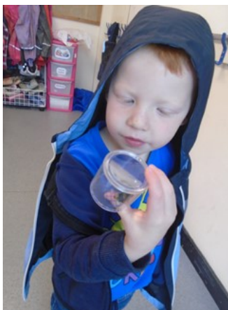
Exploring a bumble bee with a magnifying glass "Gosh, it looks bigger!"