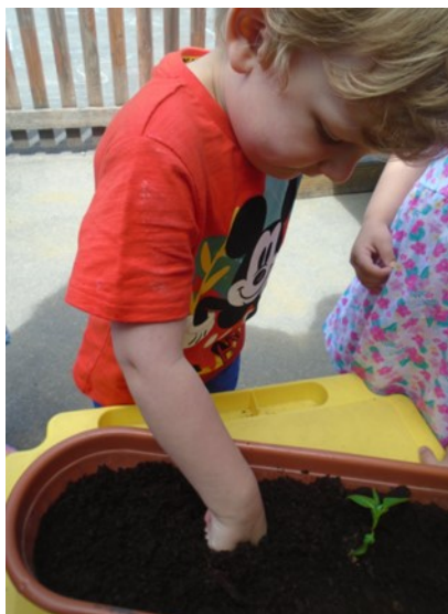
"It can go in the hole and then give it lots of water to make it grow big" Planting peppers