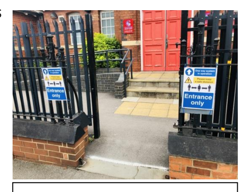
Red Infants Entrance

All families will enter the school site at the old Infants entrance and follow the social distancing lines around the school. Children should be dropped off outside their classrooms and parents stay on the white lines where possible. Once you have dropped off your child(ren), continue along the white lines to exit the school site. We appreciate your patience.