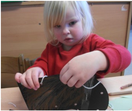
← sewing our Christmas stocking