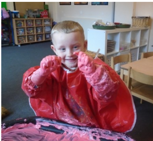
← Exploring the sensory candy cane tuff tray