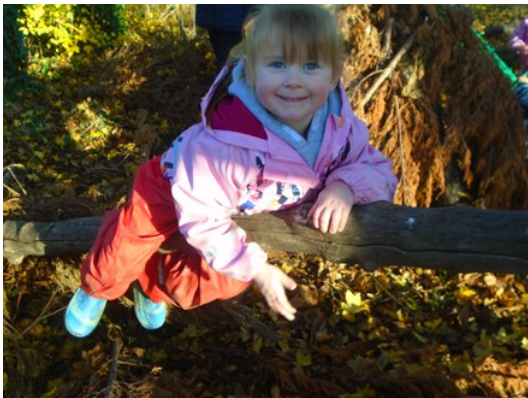
← "I did it all by myself"