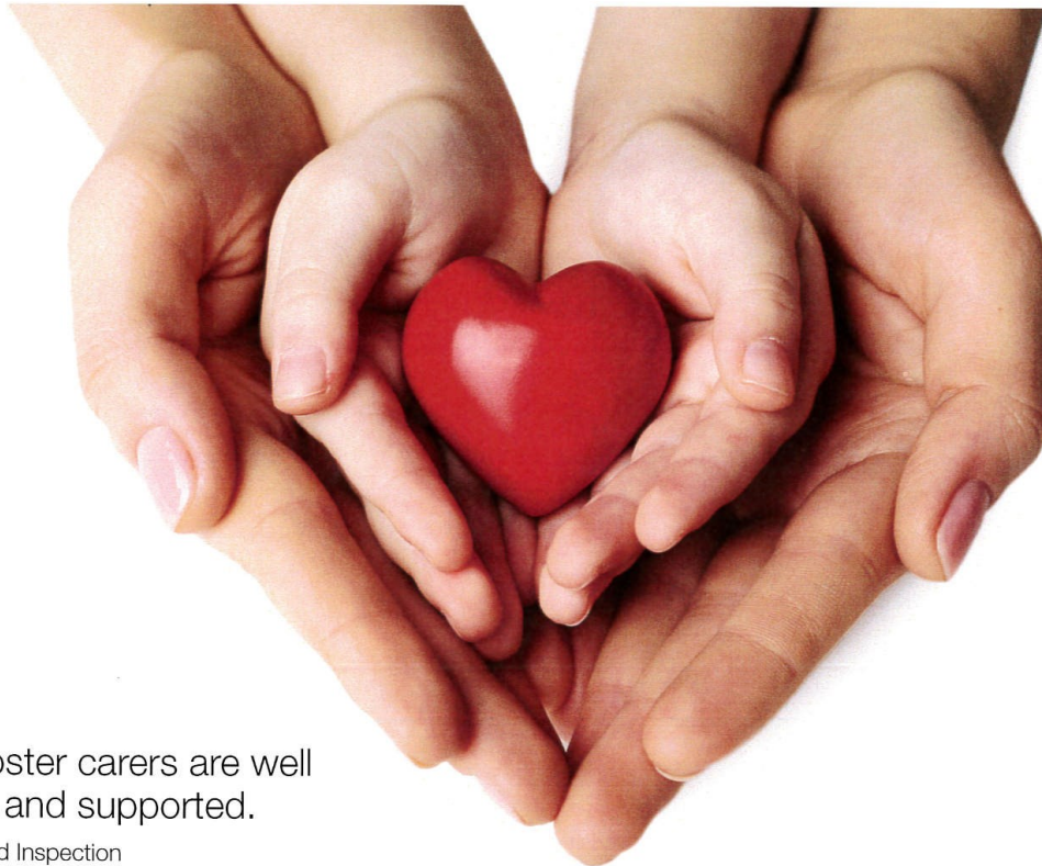
Models have been used in these photos

GCC foster carers are well trained and supported.